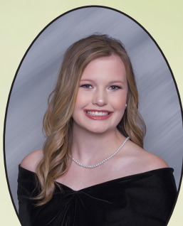
ALI LANGLOIS STEM MAGNET ACADEMY