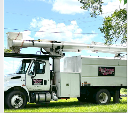
PC ELECTRIC CONTRACTOR SOLSCAPES CLEARING LINES

An essential part of providing safe, reliable service at a reasonable cost is the establishment and maintenance of a clear power line corridor. Trees contacting power lines is a primary cause of power outages. When tree limbs grow too close to power lines they can cause damage or interrupt your service.