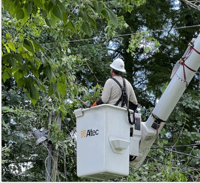
PC ELECTRIC RIGHT OF WAY CLEARING POWER LINES