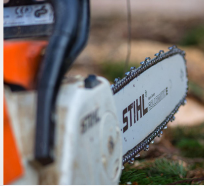
TOOLS OF THE TRADE